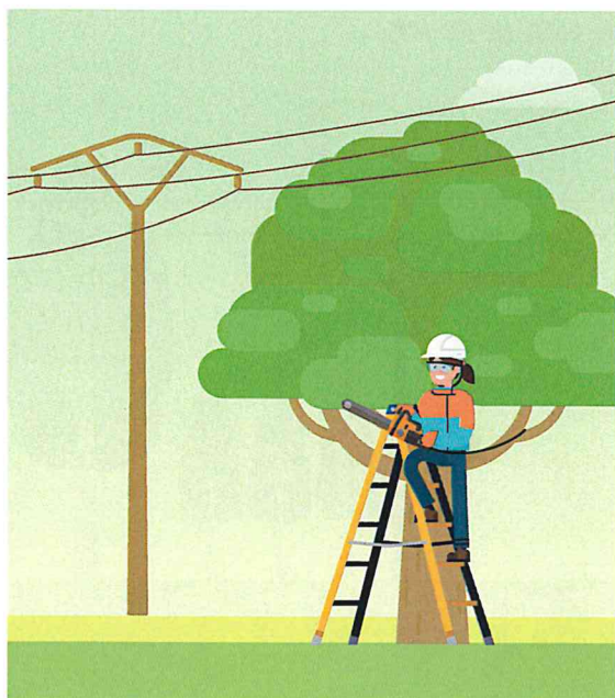
Élagage et abattage.